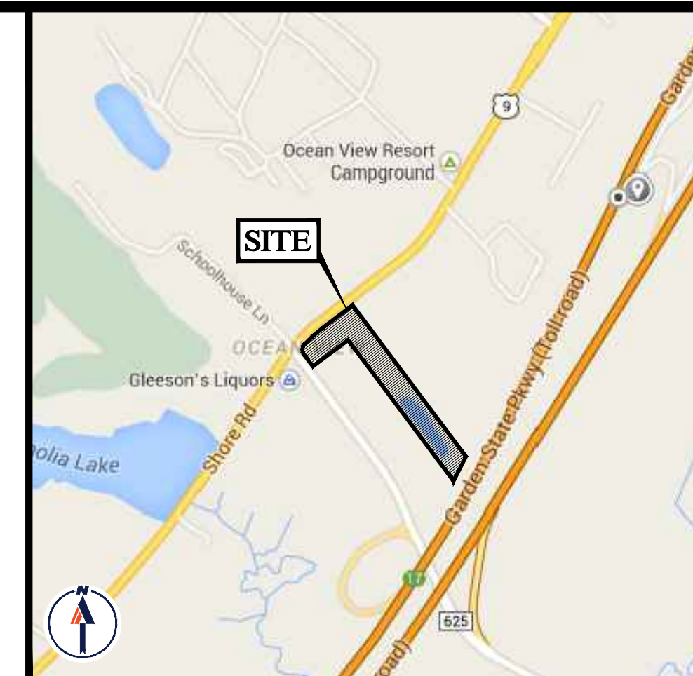
LOCATION MAP 1"=1,000' 500 0 1,000'

BOHLER THE SITE CIVIL AND CONSULTING ENGINEERING LAND SURVEYING PROGRAM MANAGEMENT LANDSCAPE ARCHITECTURE LANDMARKS AND HISTORIC PRESERVATION SERVICES PERMITTING SERVICES TRANSPORTATION SERVICES