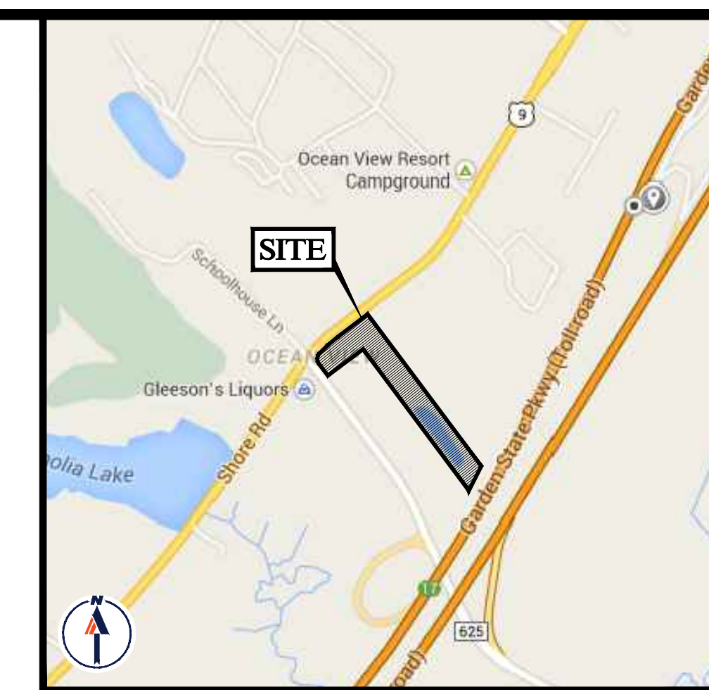
LOCATION MAP 1"=1,000' 500 0 1,000'